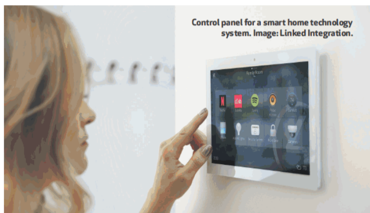
Control panel for a smart home technology system.

Automation can be as simple as having access to essential services within your home via your phone or tablet.