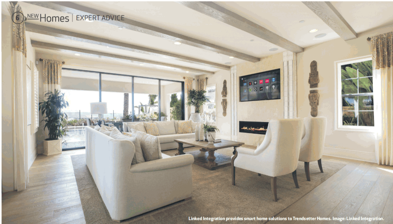
Linked Integration provides smart home solutions to Trendsetter Homes.